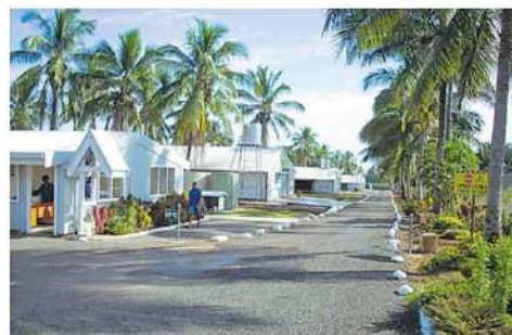
One of the 10 sites of Future Farms Pte Ltd trading as Rooster Poultry.