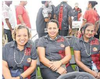
Today, Rooster Poultry is the biggest employer in Ba, with staff numbers at 450.