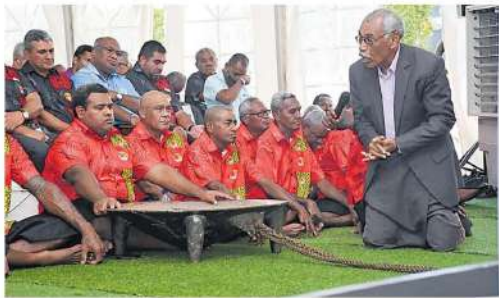
Vanua O Tiliva/Bukuya perform the traditional ceremony during the opening of the Future Farms Pte Ltd trading as Rooster Poultry's upgraded Processing Plant Facility at the Rooster Poultry in Navau Ba.