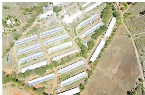
An aerial view of the Navau site.