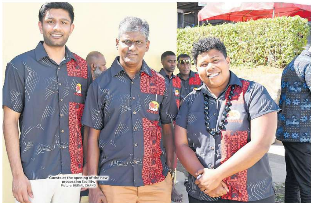
Guests at the opening of the new processing facility.