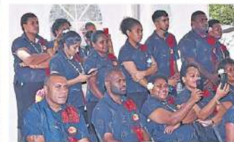
Officials of Rooster Poultry during the opening of the facility.