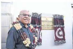
Prime Minister Sitiveni Rabuka officiated at the inauguration of the Future Farms Pte Limited trading as Rooster Poultry's Upgraded Processing Plant Facility at the Rooster Poultry in Navau Ba.