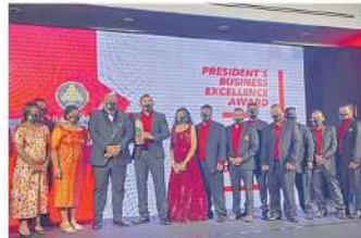
Future Farms Pte Ltd trading as Rooster Poultry receiving their second Fiji Business Excellence Presidents Award from the President of Fiji, His Excellency Ratu Willame Katonivere on December 10, 2021.