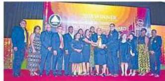
Future Farms Pte Ltd trading as Rooster Poultry receiving the prestigious Fiji Business Excellence Presidents Award from the President of Fiji, His Excellency Joji Konrote on November 2, 2018.