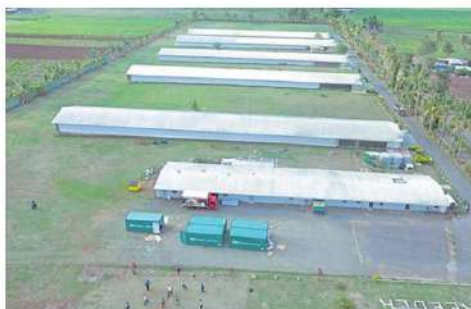
An aerial view of the Qalitu site.