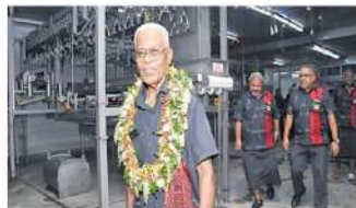
Vanua O Tiliva/Bukuya perform the traditional ceremony at the opening of the Rooster Poultry's upgraded Processing Plant Facility in Ba.